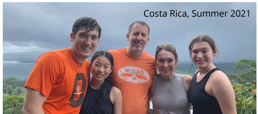
Costa Rica, Summer 2021